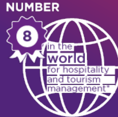
Global Ranking of Academic Subjects 2022