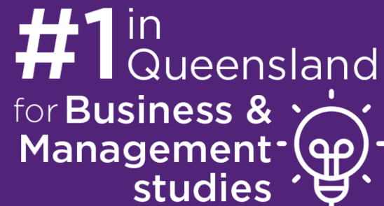
QS World University Rankings 2022