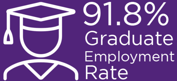
2022 QS Graduate Employability Rankings