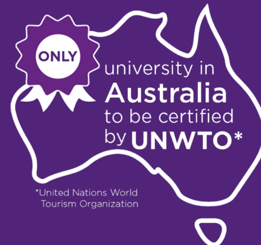
*United Nations World Tourism Organization